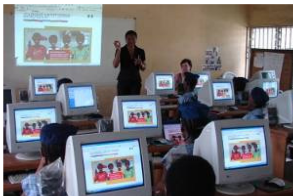
Scenes from July test workshop, Lago